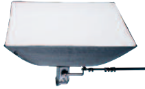
Softbox 80 x 100

60 x 80cm (23½ x 31") Rectangular shape perfect for portraiture. BW1665