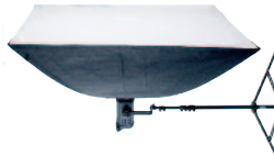
Softbox 100 x 140

100 x 100cm (39½ x 39½") Our most popular size, suitable for a wide range of photography. BW1680