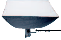
Softbox 100 x 100

100 x 80cm (39½ x 31") For larger portraits or when a softer light is required. BW1675